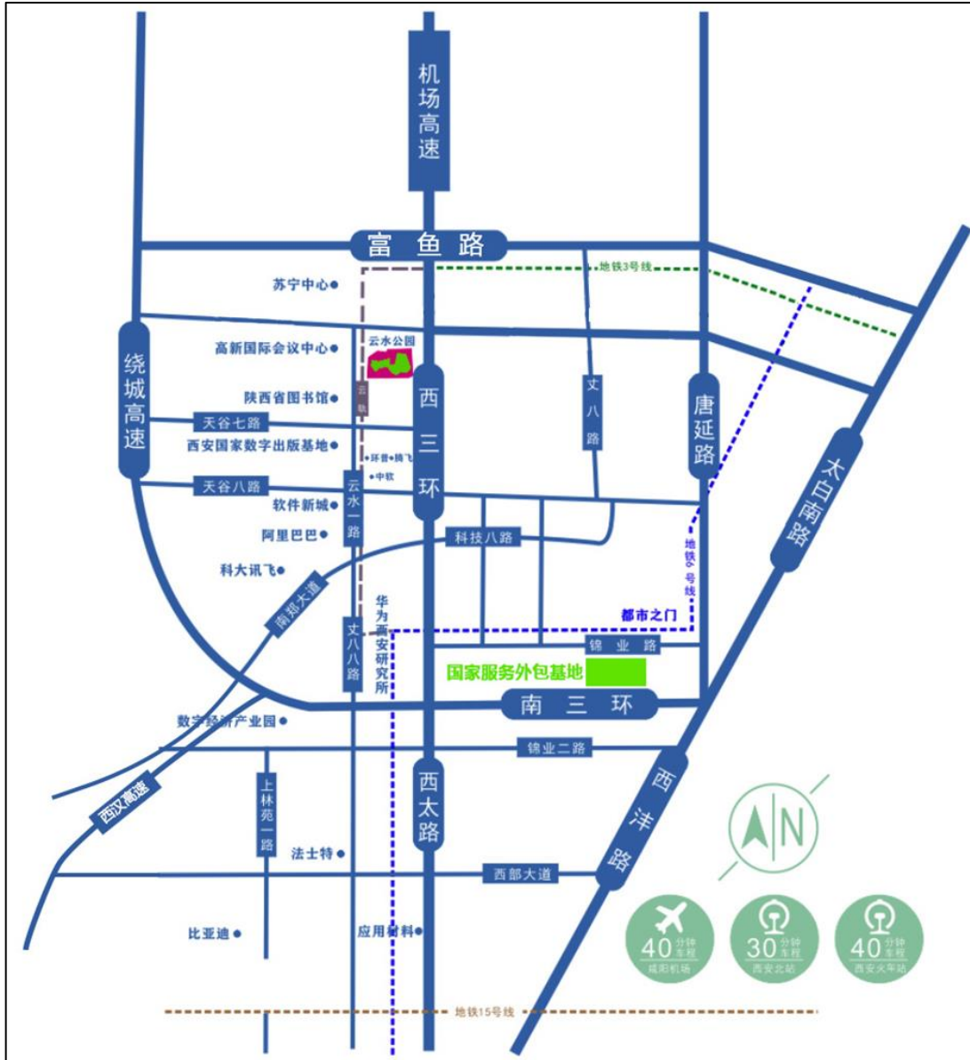
Figure 1. National Service Outsourcing Demonstration Base

126. In addition, there are a number of additional U.S. and international