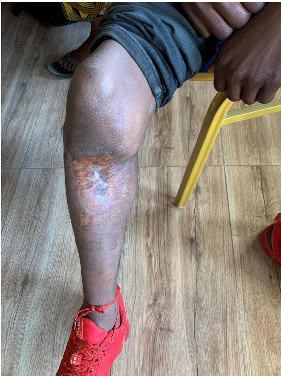
John Doe 8

35. John Doe 9 brings his claim for severe injuries to his leg in a mining accident he suffered on July 25, 2017. He was born on April 4, 2002. He went to school until the 6 th grade and had to drop out when both of his parents died. He