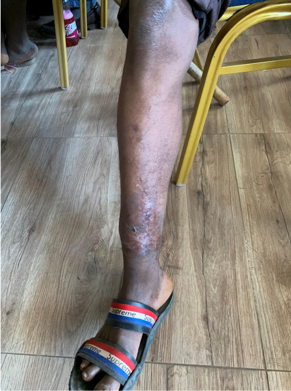
John Doe 9

36. Jenna Doe 10 brings this claim on behalf of her minor son, John Doe 10, who was born on September 18, 2002. John Doe 10 completed the ninth grade of school. When he was 14 years old, he started going to work in the mines after school was over at 1:30 pm each day. He worked at the Kamilombe No. 1 mine, which is