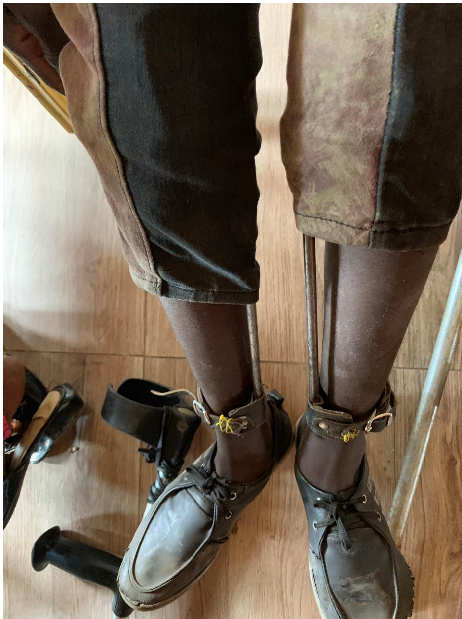
John Doe 11

38. Jane Doe 3 is the mother of James Doe 3, her child who was killed in a mining accident on April 26, 2018, when he was 14 years old. She brings the claim to recover for the death of her son. James Doe 3 was born on July 2, 2004 and finished