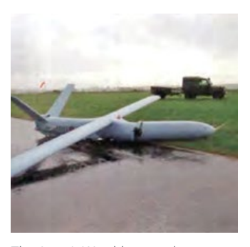
The Army's Watchkeeper drone, jointly developed by Thales and Elbit Systems has had a chequered history and has experienced a number of crashes.

Thales is involved in the nEUROn project to develop a European unmanned combat aircraft stealth technology demonstrator. The company has designed the data link communication system which allows transmission of command and control data and sensor data, and a GPS hybrid military inertial system for nEUROn, which precisely identifies the drone's position and altitude.<sup>131</sup> In addition, the company has worked alongside other industry partners in various consortia aimed at developing autonomous drone technology, such as BAE's Mantis project.