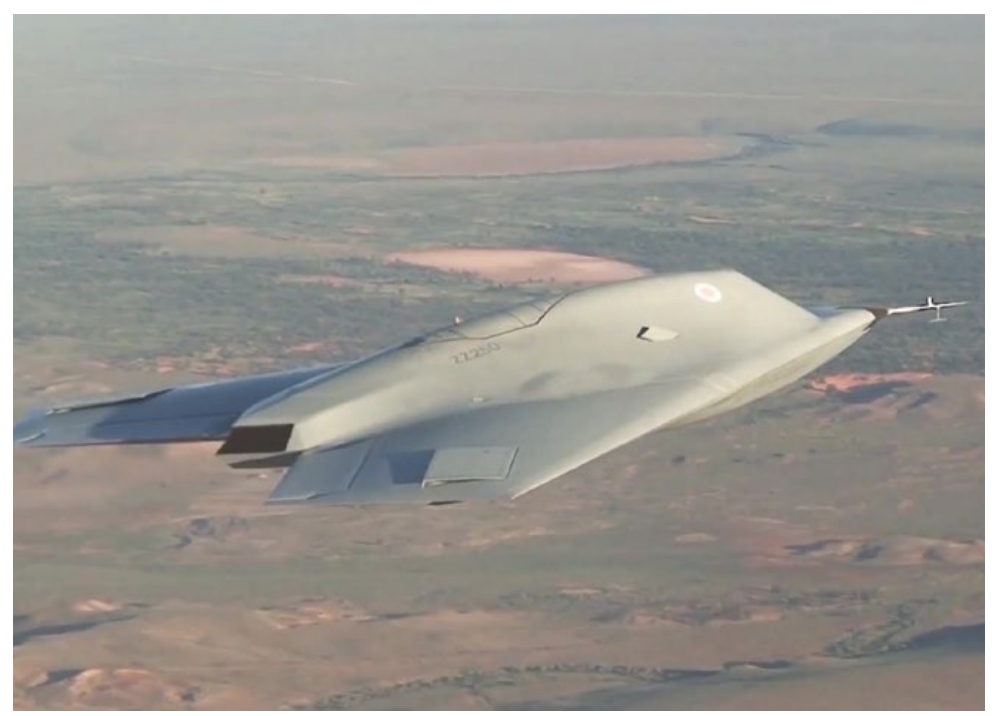
The Taranis autonomous stealth drone during flight trials at Woomera, Australia.

The system, designed for military use, would display a high degree of autonomy, employing adaptive flight control and advanced navigation and guidance software and being capable of machine-machine teaming operations to allow it to tackle air defences and operate in complex urban environments. Although mock-up images showing the Adaptable UAV concept have been published, as yet no information about real life demonstrator aircraft is available.<sup>99</sup>