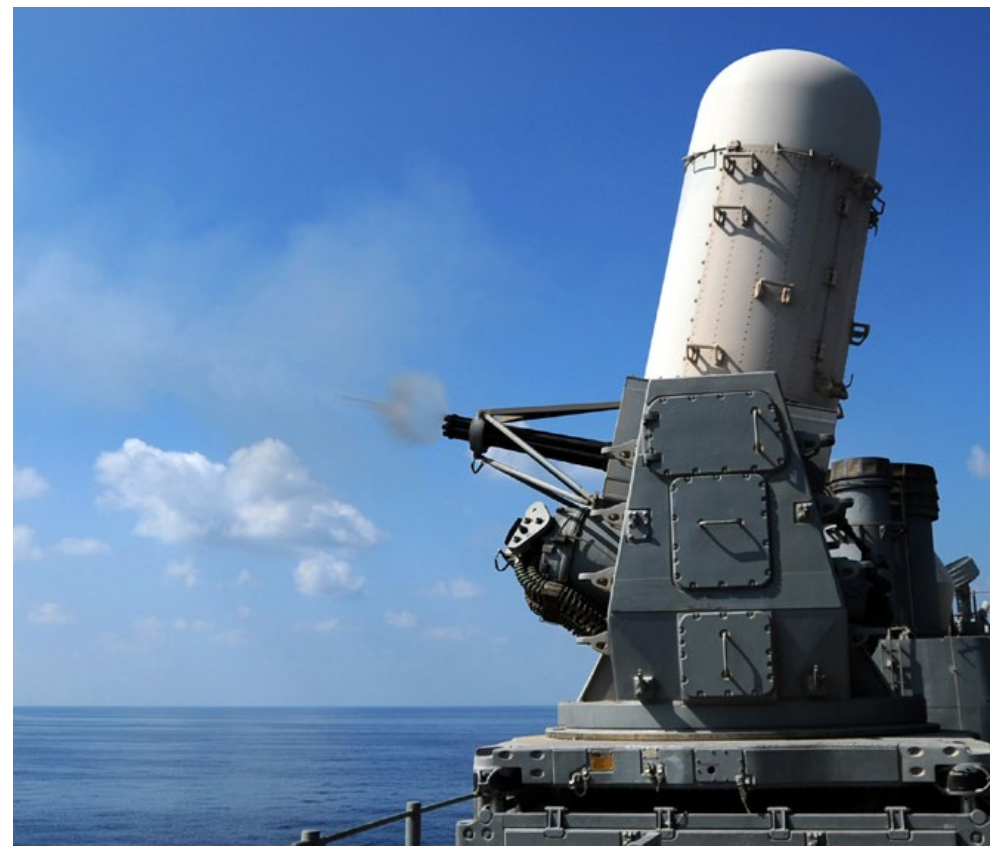
The Phalanx close-in weapons system is a highly automated system for defending ships against missile and aircraft attacks.

Such systems are able to learn rapidly, with or without human-supplied training data, and devise novel strategies radically different to human approaches to solving problems.<sup>10</sup> Machine learning and cloud robotics (the ability of individual robots to learn from the experiences of all robots in a group, resulting in a rapid growth in competence) are expected to become key enabling technologies for the future of autonomous drones and weapon systems.