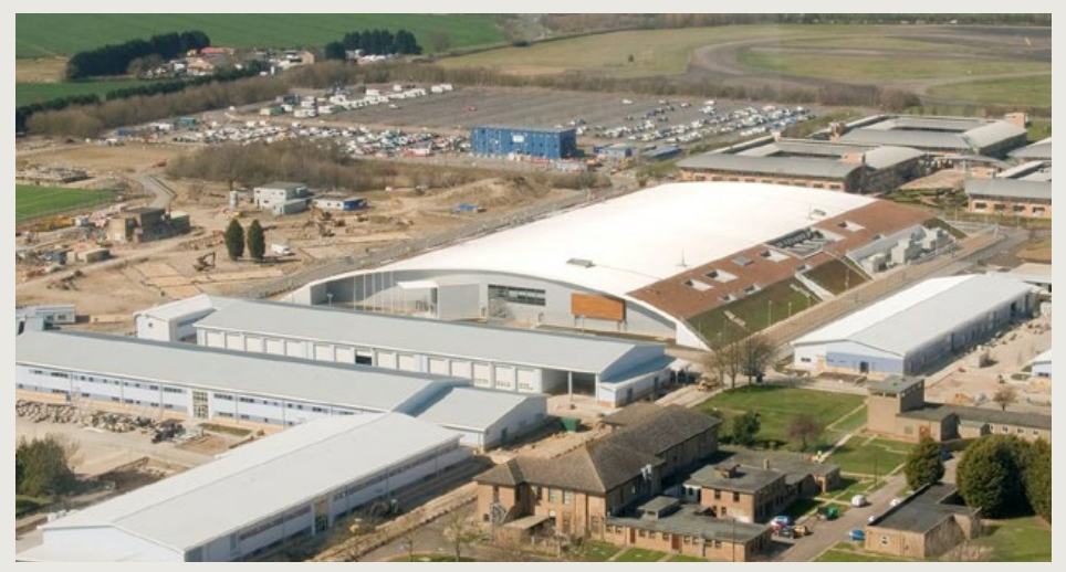
The Defence Intelligence Fusion Group is based in the 'Pathfinder' building at RAF Wyton.

The Defence and Security Accelerator programme has led to the development of a new artificial intelligence decision making system that can provide intelligence analysts with cues to potential areas of interest or anomalies, and help predict future events.<sup>88</sup>