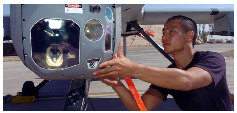
The sensor pod on a Predator drone contains sophisticated cameras, radar, and electronic tracking equipment.

Advocates of autonomous weapon systems claim that better reaction times and speedier decision-making might allow autonomous systems to make higher quality, faster decisions than their human counterparts. They also suggest that improved accuracy enabled by autonomous systems may result in a reduction in the number of civilian casualties during warfare. On the other hand, uncertainty over the outcomes of using artificial intelligence to enable autonomous weapons to make decisions raises the risk of indiscriminate killing, resulting in greater numbers of civilian deaths. The introduction of autonomy into the critical functions of a weapons system certainly entails sacrificing invaluable human traits such as empathy, judgement, and compassion which are crucial if war is to be waged consistently with humanitarian laws.