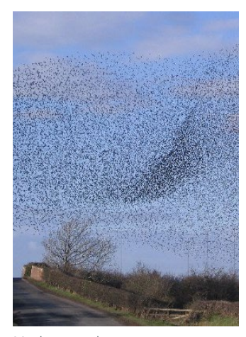
Machine-machine teaming technology may allow drones to 'self-organise' into swarms in the same way as birds and insects.

Tactical planning: Autonomous drones will require software that will allow them to interpret a dynamic environment and formulate the best tactics and plan for responding to changes around them. The ability to rapidly update information databases in real time could allow a drone to decide on the timing of an attack on a target so as to gain the maximum military advantage.