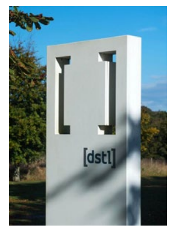
The Defence Science and Technology Laboratory (DSTL) has funded research into autonomous systems, sensing technology, and artificial intelligence.