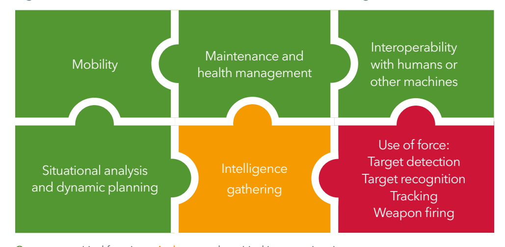
Figure 2: Functions involved in the control of a drone, showing 'critical functions.'

Today's armed drones are often described as 'remotely controlled', but in reality many of their key functions are already automated or autonomous, for example in take-off and landing, navigation, and software updating. Many would consider these to be acceptable functions to automate, and there is much greater concern about weapons systems autonomously identifying and selecting targets, and even more so over them making decisions on when to use force and operate a weapon. It can therefore be helpful to focus on autonomy in the different functions of a weapons system, rather than autonomy in the overall system itself.<sup>18</sup> A key factor therefore would be the level of autonomy in functions required to select and attack targets (usually known as critical functions), such as target acquisition, tracking, selection, and fire control.