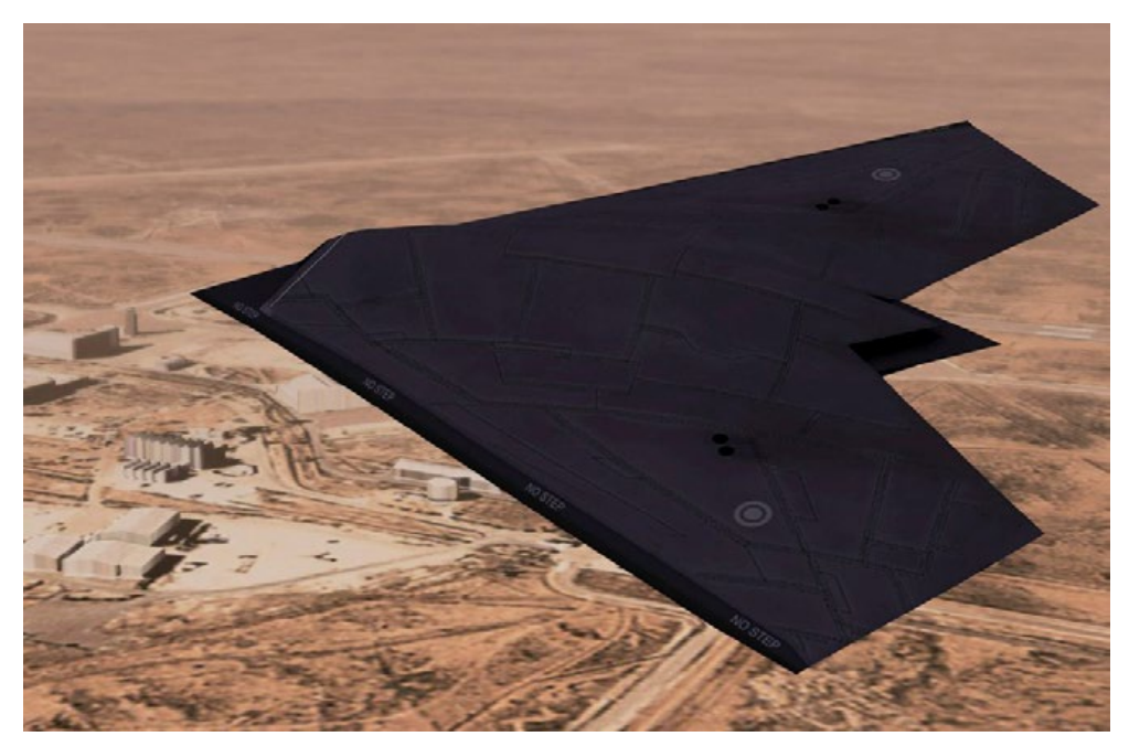
BAE Systems' Taranis stealth drone is able to fly itself and features a number of autonomous systems.

Excellent studies in the area of autonomous weapons have recently been published by the by International Committee of the Red Cross,<sup>4</sup> the United Nations Institute for Disarmament Research,<sup>5</sup> and the Stockholm International Peace Research Institute,<sup>6</sup> analysing the consequences of developing autonomous weapon systems. This study draws on these sources but does not seek to replicate them, and interested readers are recommended to consult them.