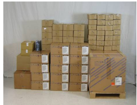
Figure 3B: The IBM boxes after we unpacked them from the shipping boxes.