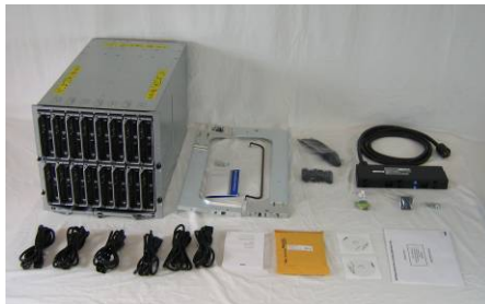
Figure 1A: The Dell equipment immediately after we unpacked it.