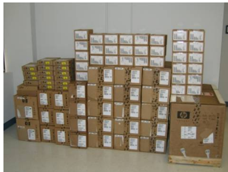
Figure 3B: The HP boxes after we brought them up to our lab.