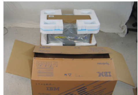
Figure 5C: The IBM server with outer cardboard covering removed.