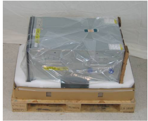
Figure 6C: The IBM server with foam pieces removed.