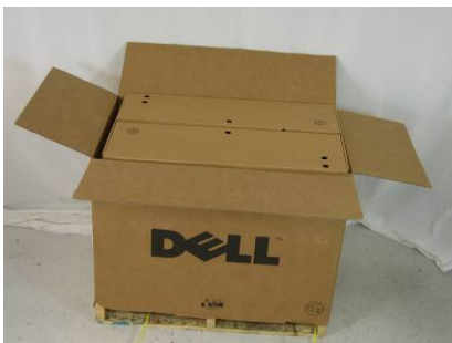
Figure 4A: Opening the Dell server box.