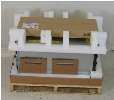
Figure 5A: The Dell server with outer cardboard covering removed.