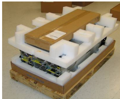
Figure 5B: The HP server with outer cardboard covering removed.