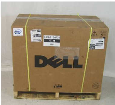
Figure 3A: The Dell box upon delivery in our lab.

The smaller boxes contained additional boxes inside. After unpacking these boxes, we had counted 62 total boxes for the IBM installation. Figure 3C shows these 62 boxes.