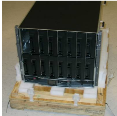
Figure 6B: The HP server with plastic wrap removed.