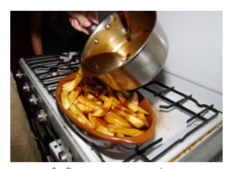
~ 3: Pour gravy on chips ~