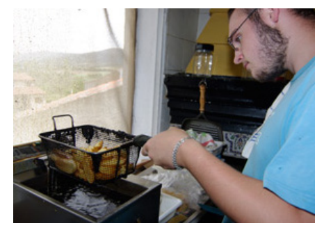
~ 2: Fry chips ~